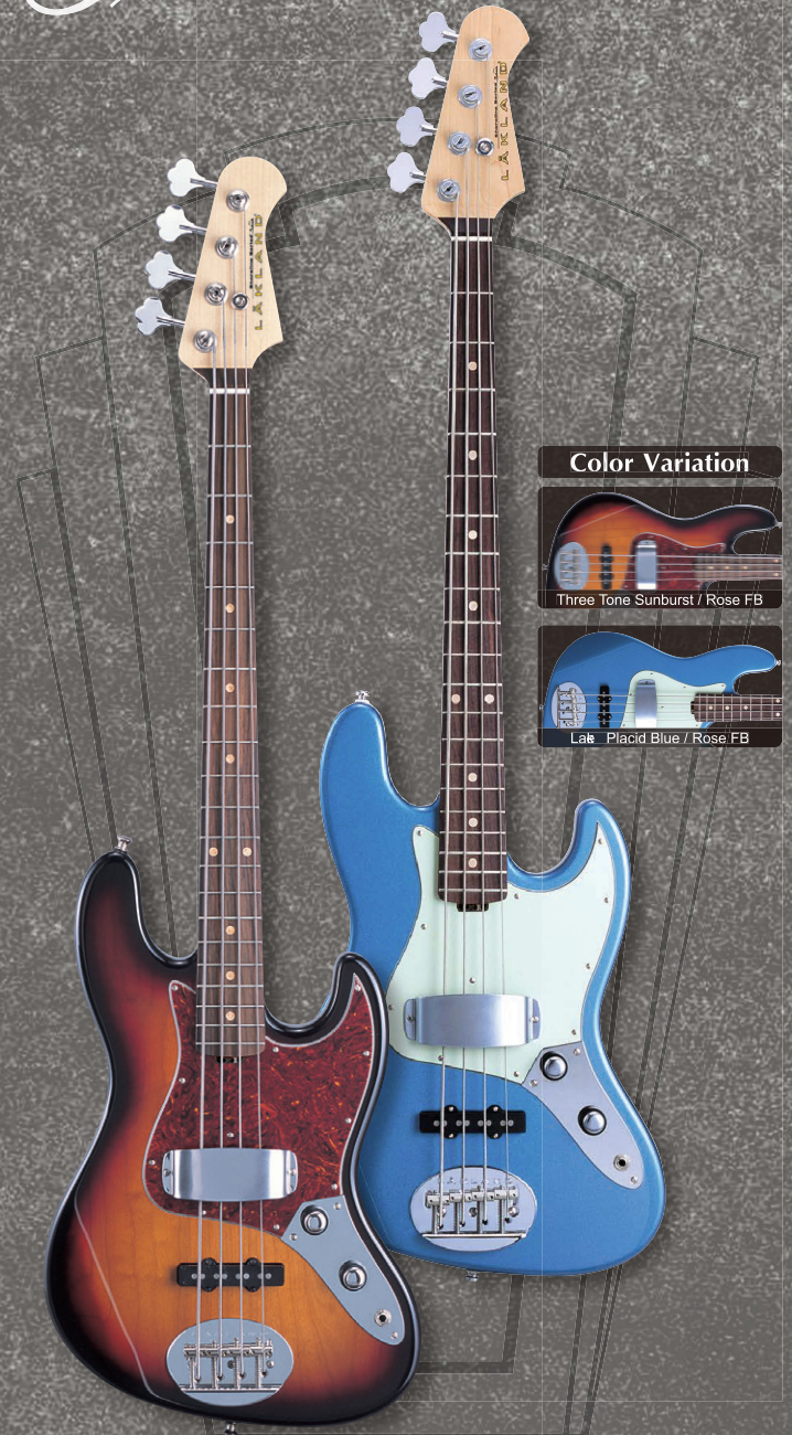
SL 44-60 (Alder)