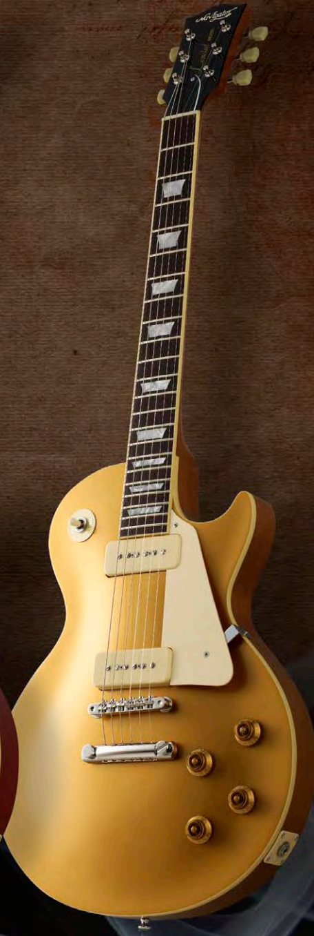
N-LP-480 LTD/P Gold