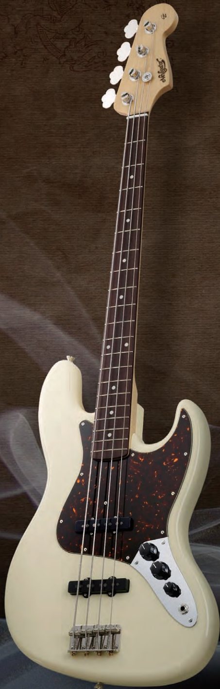
N-JB-380 LTD Vinatge White