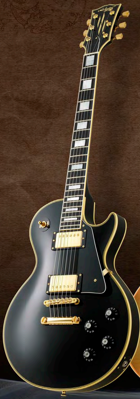
N-LP-480 CTM Black