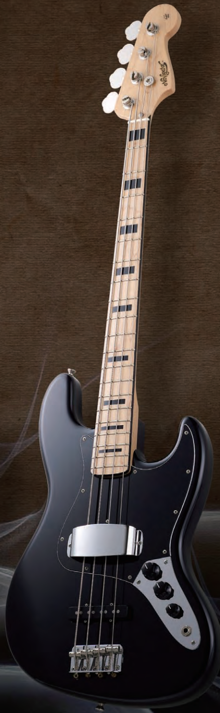
N-JB-400 LTD Black