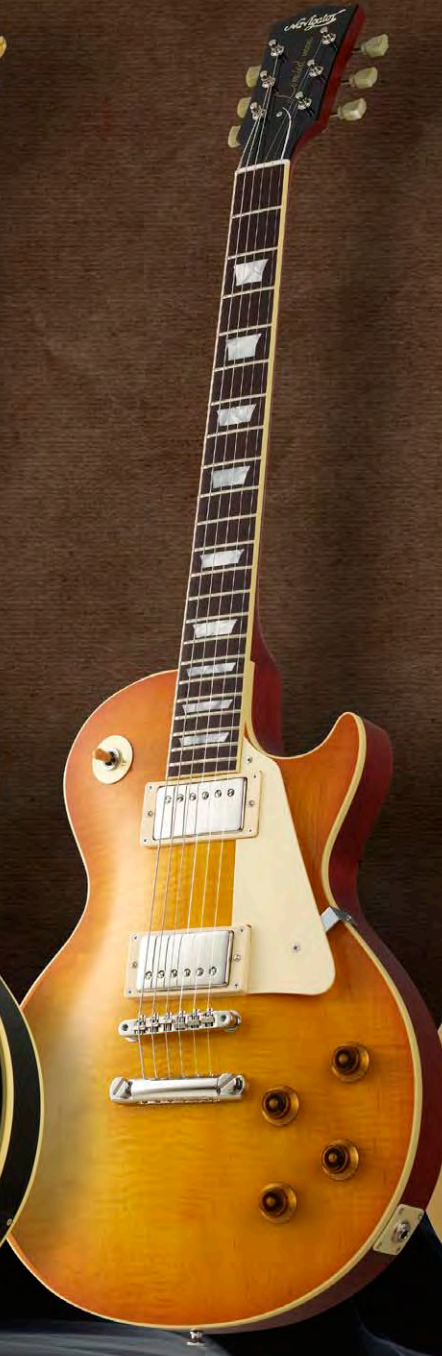
N-LP-480 LTD Honey Sunburst