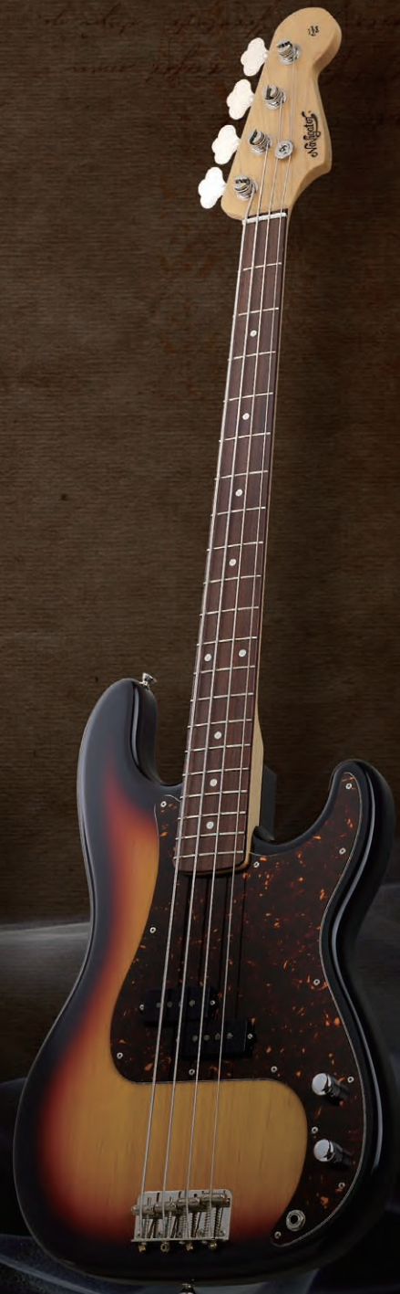
N-PB-360 LTD 3 Tone Sunburst